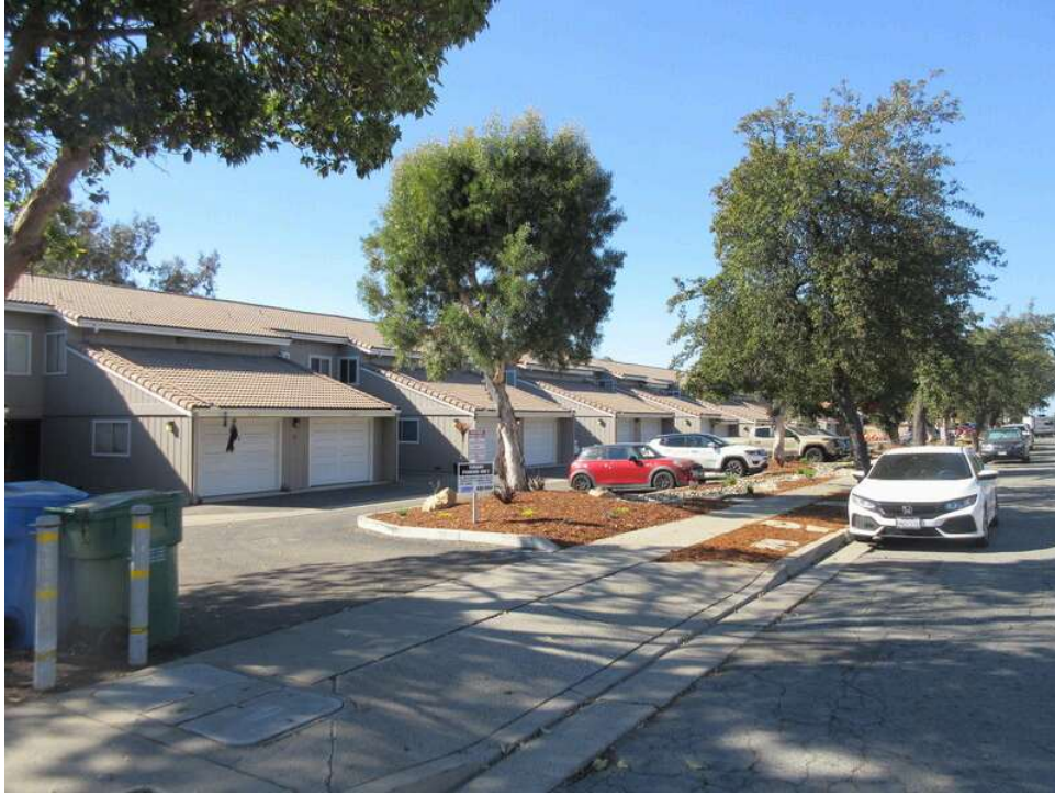
23. View of northwest-adjointing property