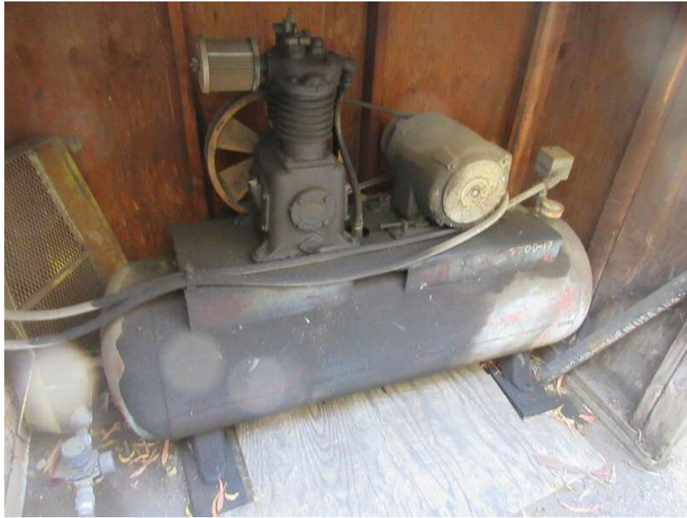
17. View of air compressor