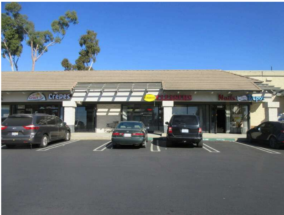
4. View of the subject property (Unit 1468)