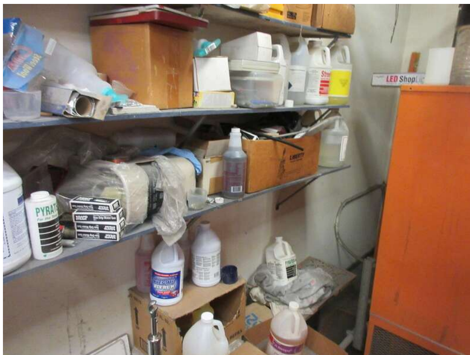
14. View of laundry detergents