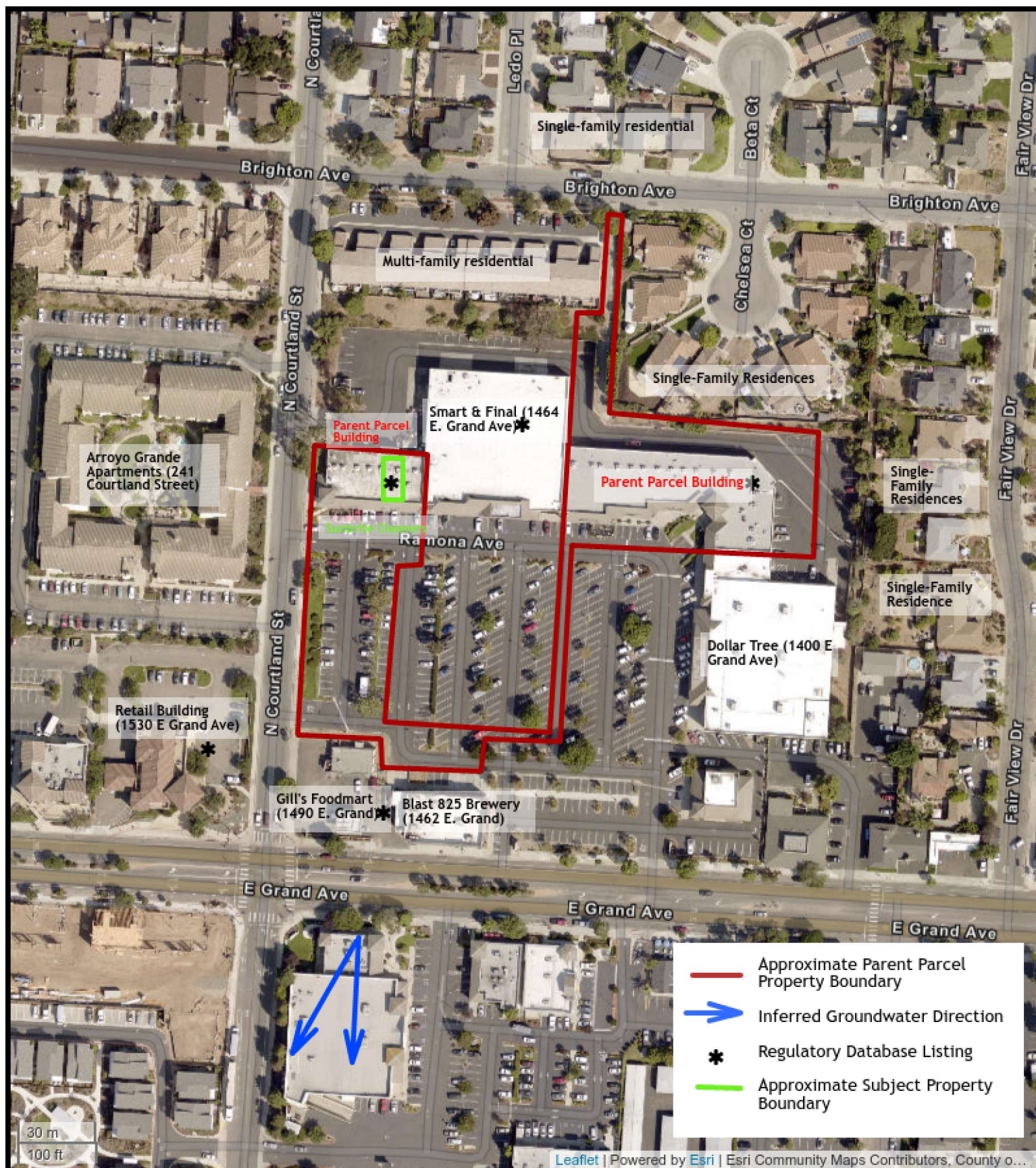
FIGURE 2: SITE MAP

1468 E Grand Avenue, Arroyo Grande, California 93420