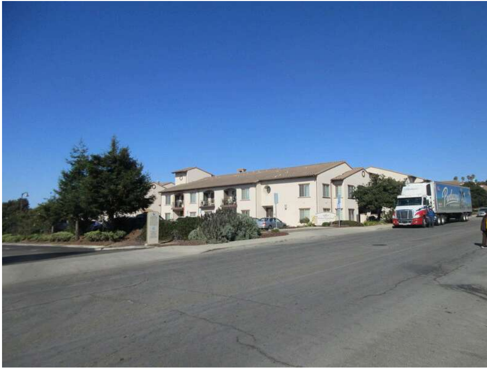
21. View of west-adjoining property