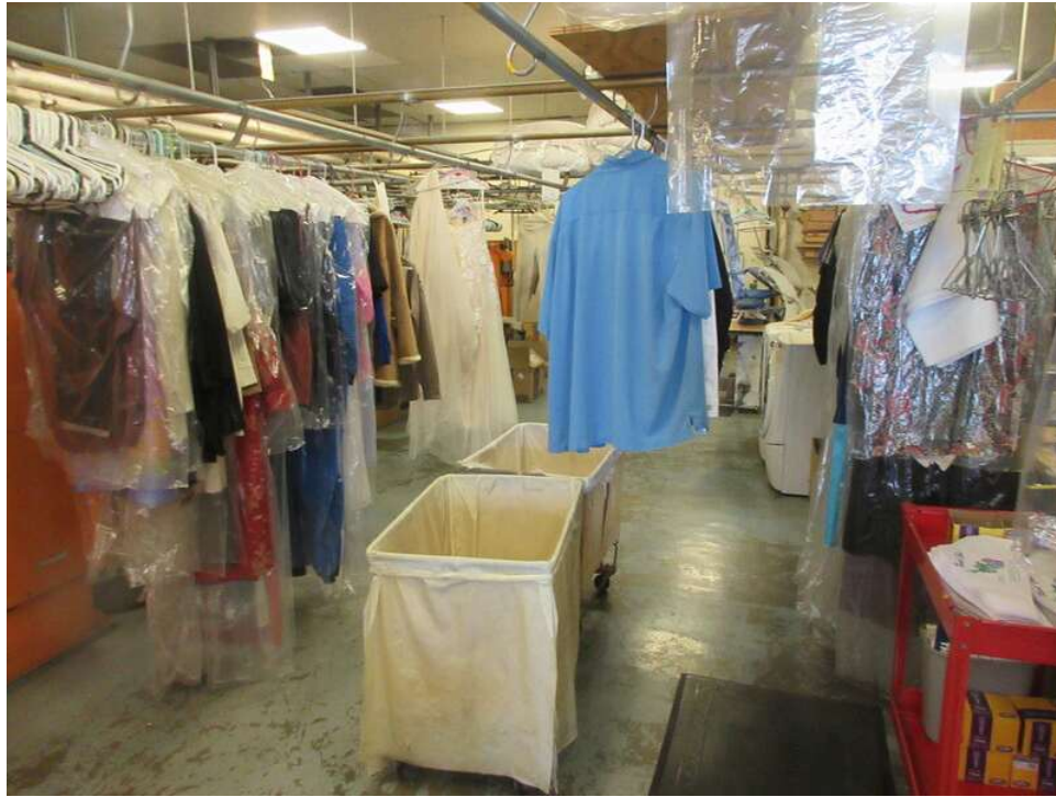
9. View of sunbrite Cleaners