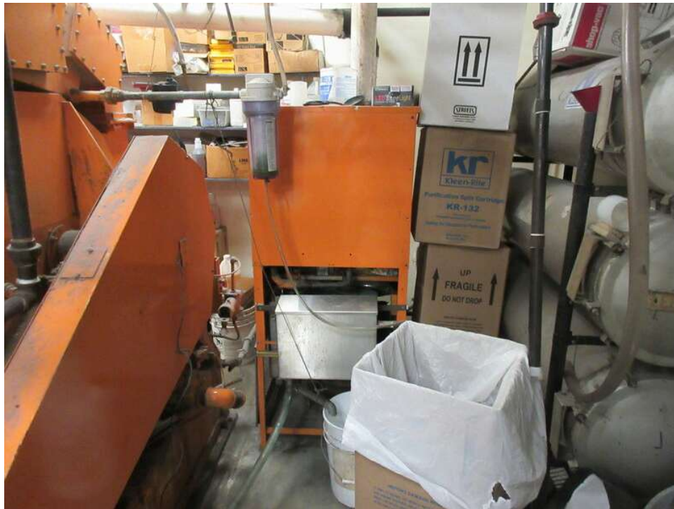
13. View of dry cleaning machine (not in use)