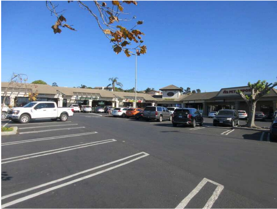
3. View of parent parcel building