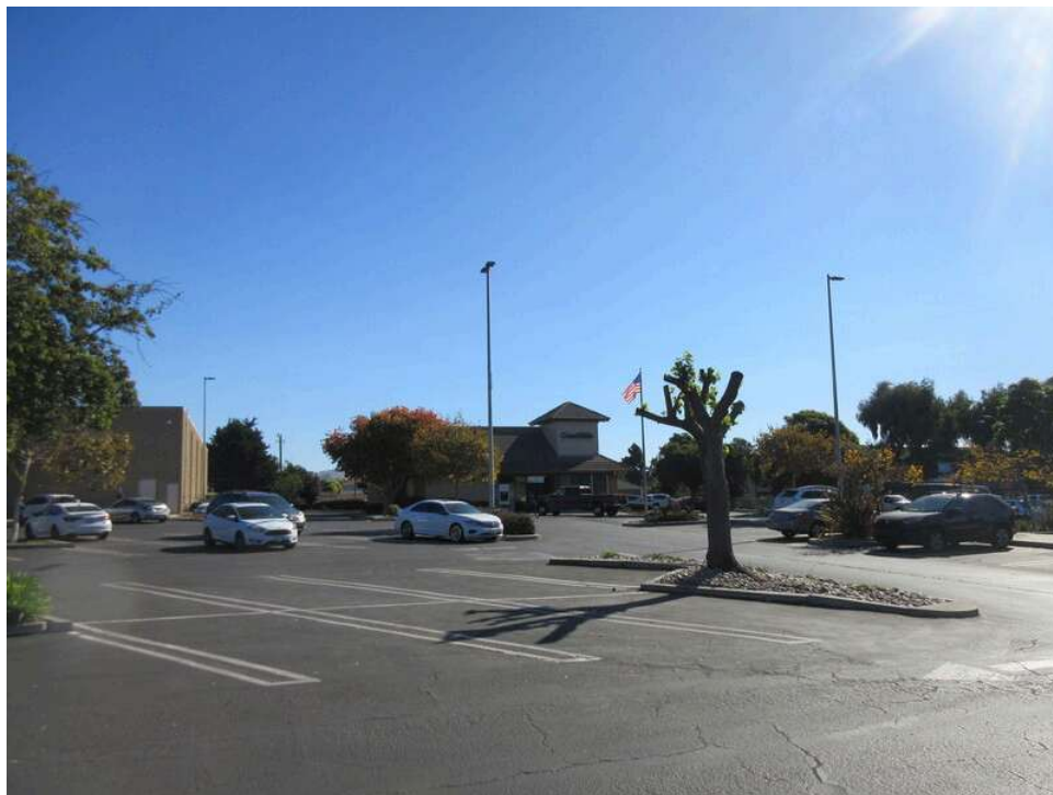
18. View of southeast-adjointing property