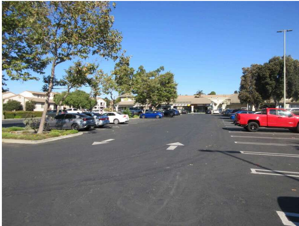
1. View of parent parcel