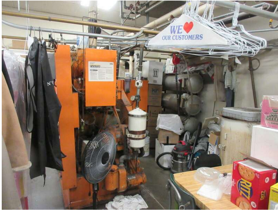
11. View of dry cleaning machine (not in use)