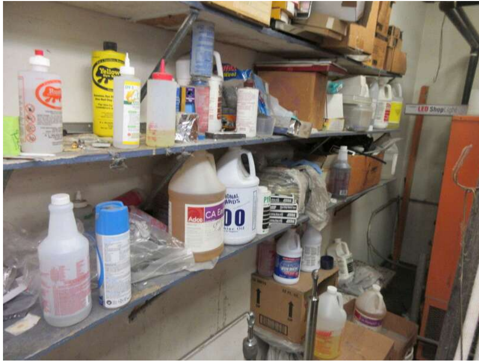
15. View of laundry detergents