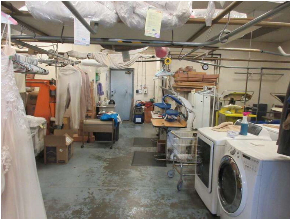
8. View of sunbrite Cleaners