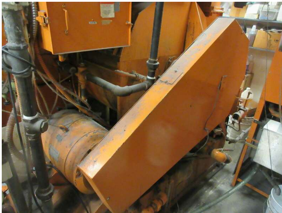
12. View of dry cleaning machine (not in use)