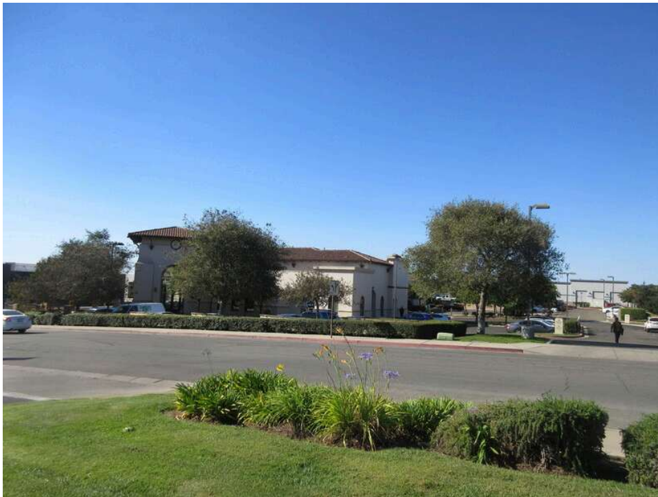
22. View of west-adjoining property