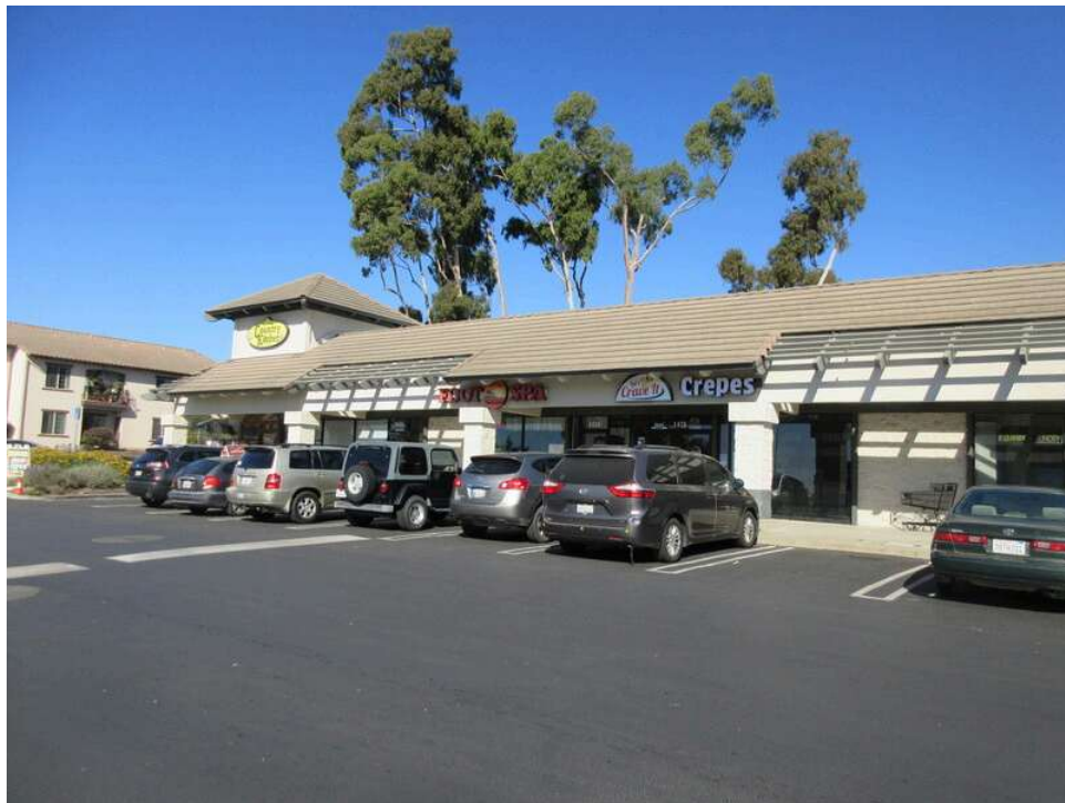
2. View of parent parcel building