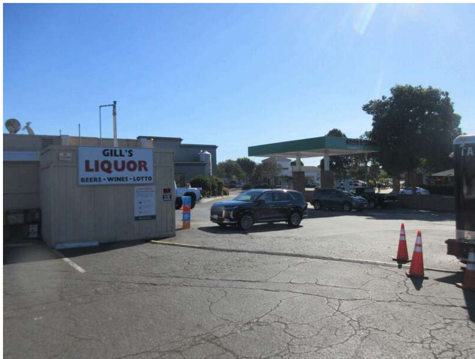
20. View of south-adjoining property