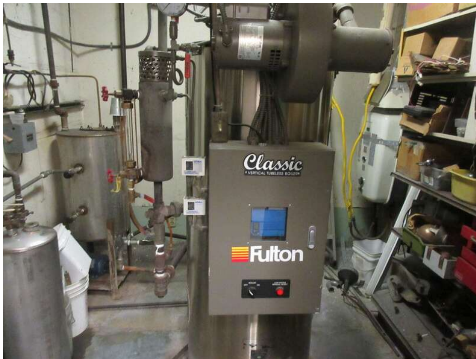
16. View of boiler