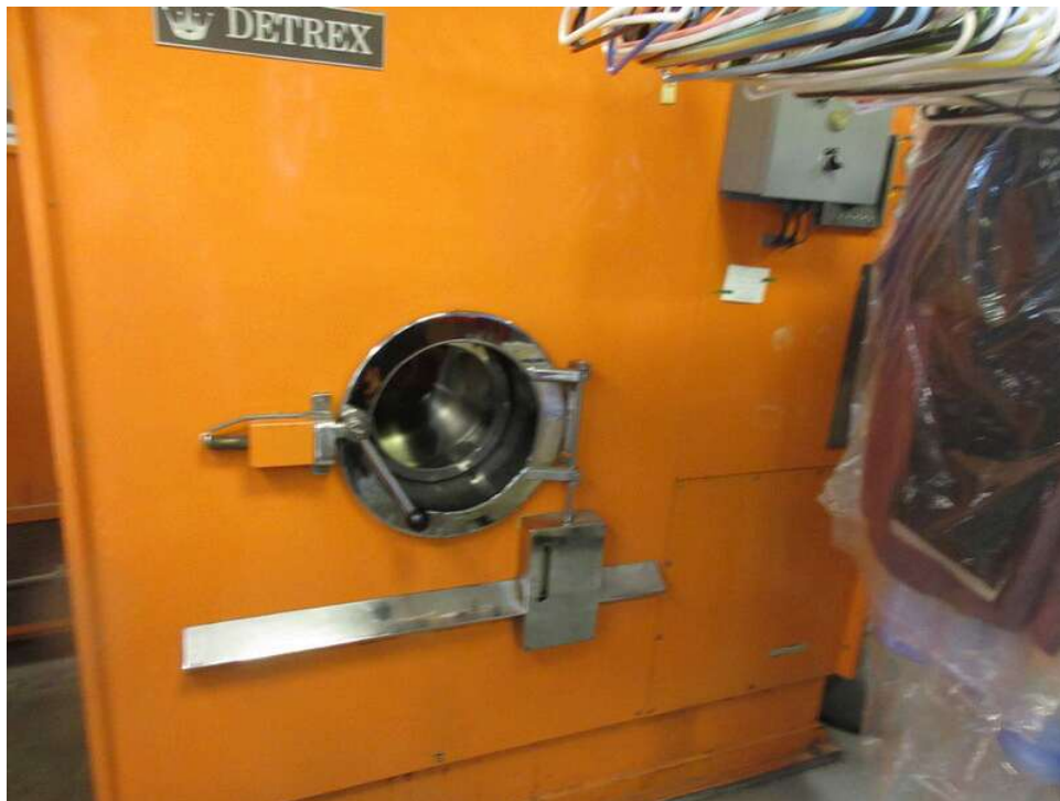
10. View of dry cleaning machine (not in use)