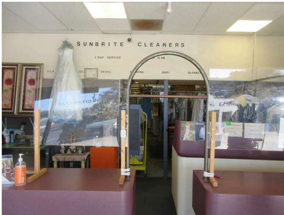
6. View of sunbrite Cleaners