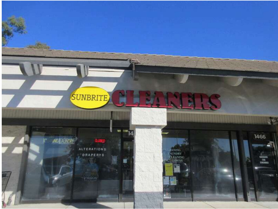
5. View of the subject property (Unit 1468)