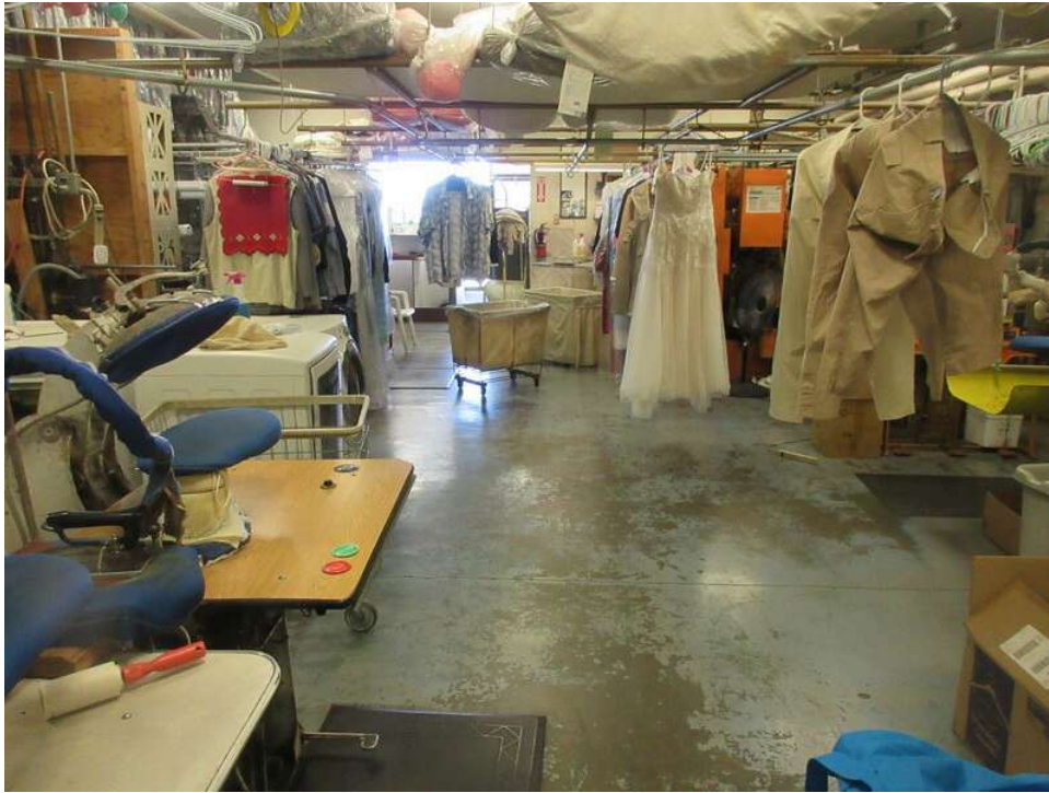
7. View of sunbrite Cleaners