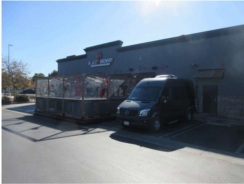
19. View of south-adjoining property